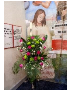
Photo of the memorial painting in St Paul's church of the tragic sinking of The Herald of Free Enterprise in 1987 generously funded by St Richard's School.

SYCAMORE COURSE, FIDES & BIBLE STUDY all combined session at St. Finbarr's to begin on 18th March, 7pm . Arrive for coffee, followed by inspiring videos, conversations and prayer. All are welcome.